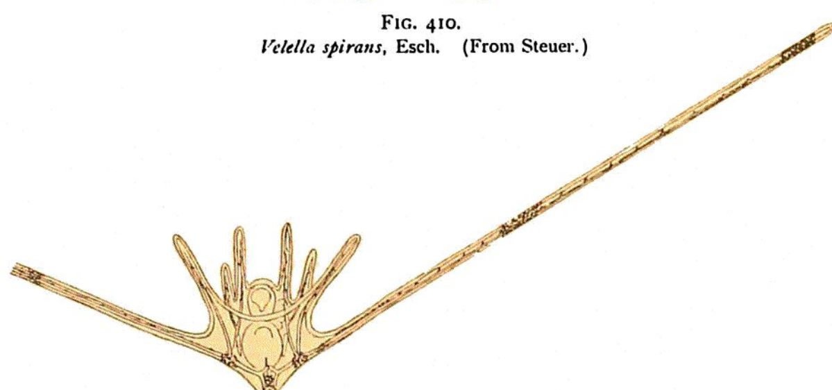
FIG. 411. Larva of Ophiothrix fragilis, O. F. Müller (about 200). (From Mortensen.)