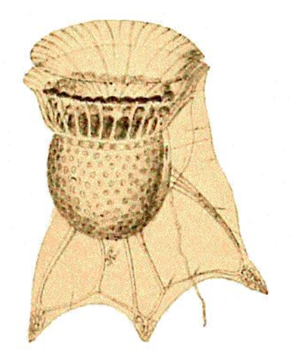
FIG. 235. ORNITHOCERCUS MAGNIFICUS. With brown flagellate cells in the space between the ring-borders (\frac{4\pi}{2}) . (Schütt.)

Besides these highly-organised forms, which I have given as instances, the peridineæ include many with a far more simple structure. There are, especially in the samples collected by