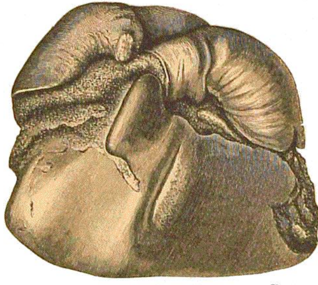
FIG. 128.—PETROUS AND TYMPANIC BONE OF ZIPHIUS CAVIROSTRIS. "Challenger" Station 286, South Pacific, 2335 fathoms.

ish colour, usually associated with greenish or brownish casts of calcareous organisms (foraminifera, etc.); in fact, the rounded