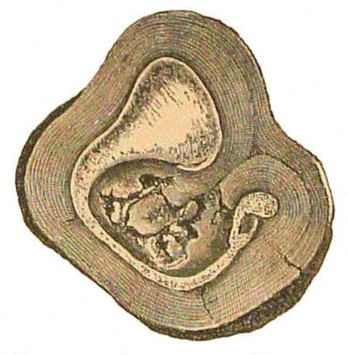
FIG. 129.—SECTION OF A MANGAN-ESE NODULE, SHOWING A TYM-PANIC BONE OF MESOPLODON IN THE CENTRE.

"Challenger" Station 160, Southern Ocean, 2600 fathoms.