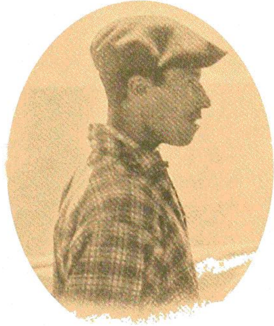
FIG. 45.—PORTUGUESE FISHERMAN.

for a long time past attracted the attention of hydrographers. Through this narrow channel the exchange of water between