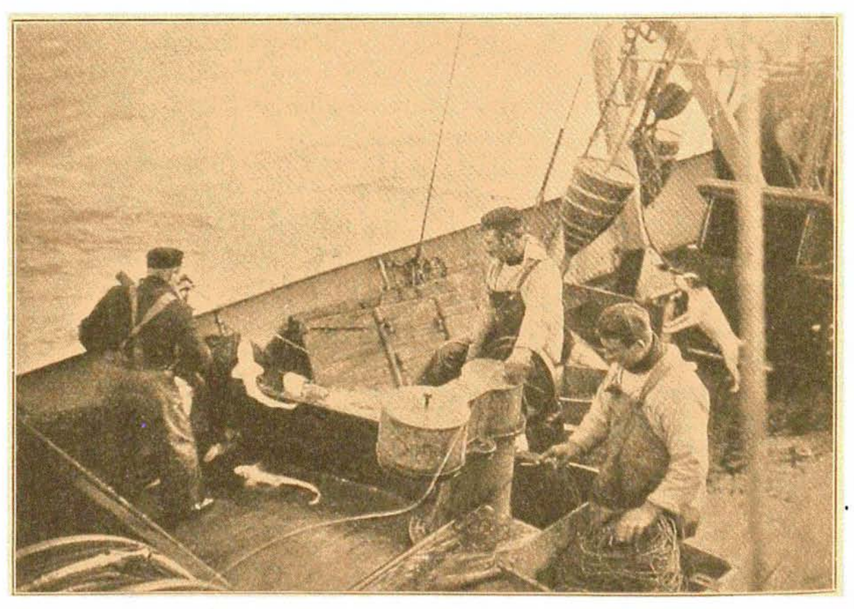
Fig. 27.—Hauling in Long Lines by means of Line Winch.

5160 metres with 8750 metres of wire; we commenced lowering at 5.45 A.M. and started trawling at 11.20 A.M.; hauling in began at 2.50 P.M., and the trawl was once more on board at